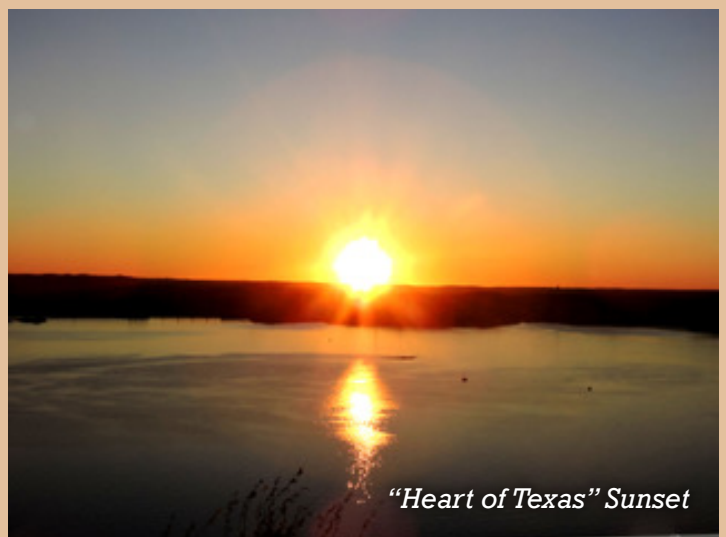
"Heart of Texas" Sunset