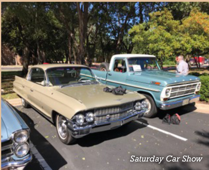
Saturday Car Show