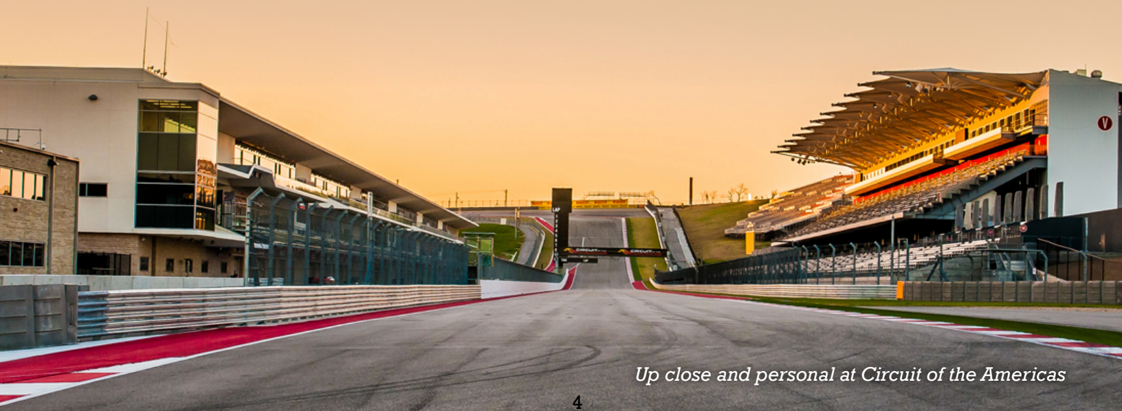
Up close and personal at Circuit of the Americas