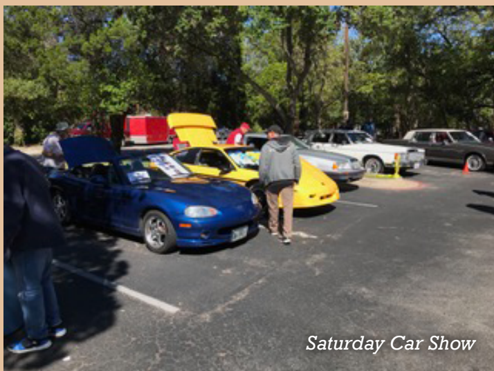
Saturday Car Show

This was followed by a behind-the-scenes tour of the control room and a pass through the pits and past the team garages. Since the F-1 race was coming up just the following week, security was tight. However, we did get to see engines and parts being unloaded, as well as members of the teams, but no drivers. We had lunch at an exotic meat restaurant where the most ordered item appeared to be yak--and yes, it was good.