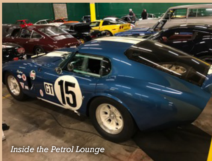
Inside the Petrol Lounge

Finally, we gathered Sunday morning in a send-off, and are missing everyone already, and can't wait to see them next year when Classic Chassis Car Club Dallas hosts us for Golden Girls 2020 Solid Gold! Hope to see you there. ●