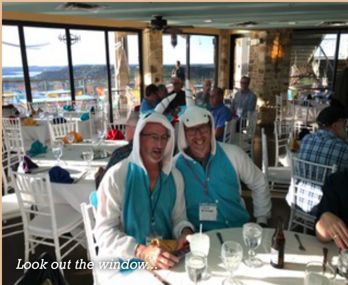
Look out the window...