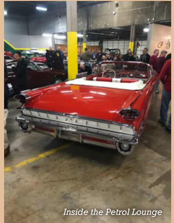
Inside the Petrol Lounge