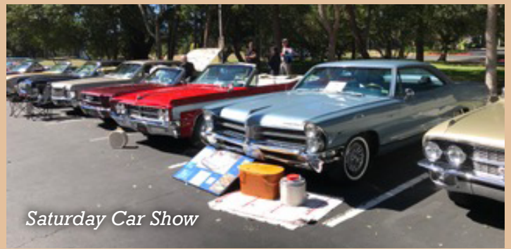
Saturday Car Show