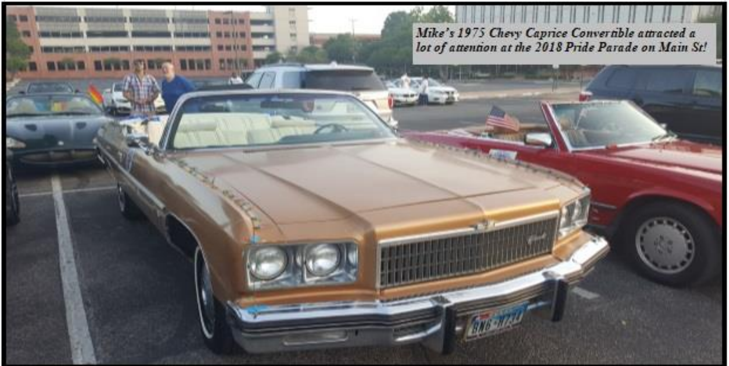
Mike's 1975 Chevy Caprice Convertible attracted a lot of attention at the 2018 Pride Parade on Main St!